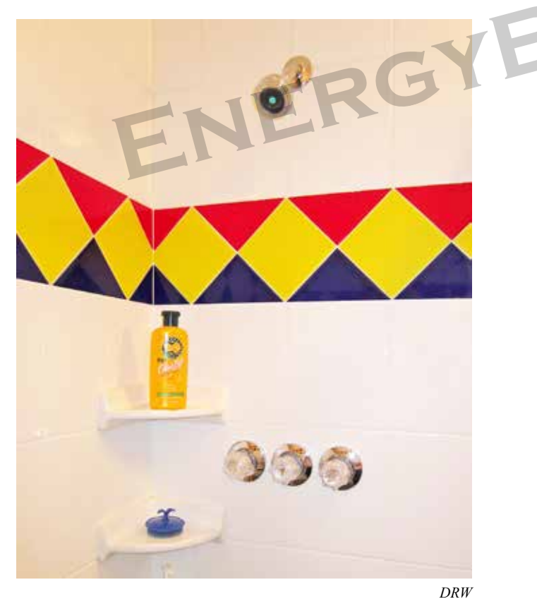
Figure 5-1. This classic arrangement of shower faucets, hot and cold with the diverter valve between them, usually is best. However, there are benefits in not locating the faucets under the shower head.

Homes also use a lot of water outdoors, mostly for lawns, shrubbery, and gardens. Outdoor water usage is seasonal. Variation among households is even greater than for indoor usage. Drier regions use the most outdoor water. For example, outdoor use accounts for 44% of average household water use in California, but only 7% in Pennsylvania.