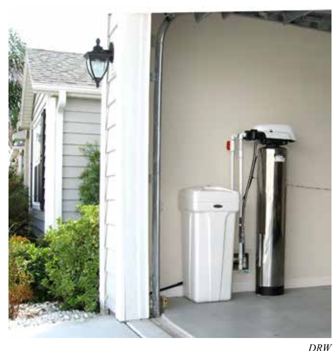
Figure 5-25. Water softener. In the metal cylinder on the right, common salt replaces hardness minerals with sodium compounds. The plastic bin on the left contains salt for replenishing the unit. The sodium that is added to the water may aggravate heart disease.

There are two designs of sediment filters, "surface" filters and "depth" filters. Surface filters are simple filters that have a single pore size. Depth filters are made in layers having different pore sizes. The largest pore size is on the upstream size and deeper layers have progressively smaller pore sizes. Depth filters are intended to provide longer life when the debris in the water supply has a range of particle sizes.