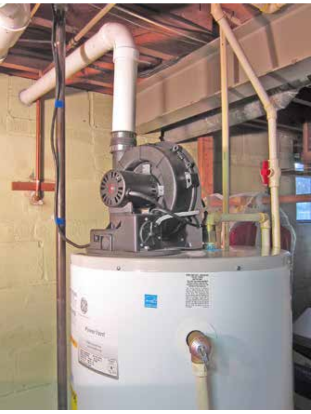
Figure 5-17 shows how pipe loops are installed. The descending legs can be short because the lighter hot water remains at the top. A drop of about 6" (15 cm) is ample. Pigtail loops in the inlet and outlet pipes have been used for the same purpose, and they probably work as well.

A simple, reliable way to avoid this energy waste is to install short descending legs in the tank's inlet and outlet pipes. The lighter hot water at the top of the tank cannot drop into the denser cold water in the descending legs. As a result, the hot water cannot move by convection into the surrounding pipes.