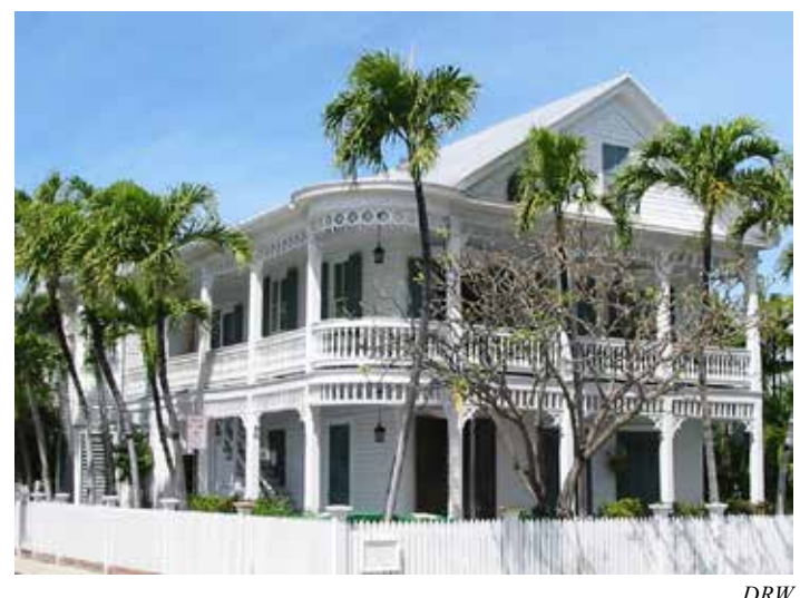
Figure 2-18. A house that uses both a porch and a balcony for effective shading.

Fabric awnings can be attractive when new, but they begin to look shabby after several years. This makes them expensive in relation to their benefit.