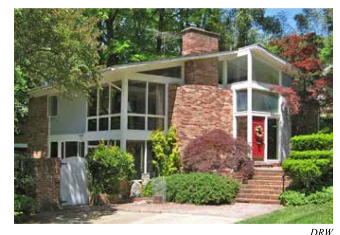
Figure 2-57. The window design of this house provides little privacy because the bottoms of the windows are at floor level. Without curtains or other privacy screens, the occupants have chosen to live in a public showroom.

If you can eliminate the need for privacy shades by using tall window sills, view and daylighting are always accessible. You can leave the windows open at night for ventilation. And, in bedrooms, sunlight coming through the windows makes it easier to start the day.