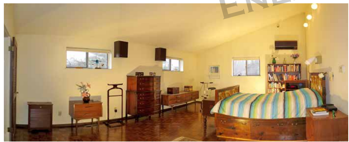
Figure 2-55. Tall window sills provide effective daylighting for this bedroom while maintaining privacy. The tall sills also allow furniture to be placed beneath the windows.

The height of the window sills is governed by your downward view. In a house on a hillside, windows facing a downhill view should have low sills. But, if your living room windows face a large deck, raise the sill height and don't waste window area for a view of the deck floor.