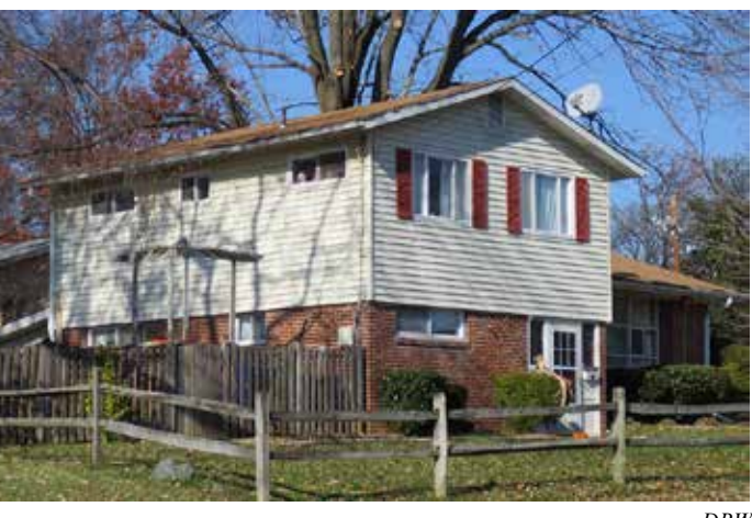
Figure 2-56. Tall window sills may create a large expanse of exterior wall, as here. Therefore, consider shrubbery or other deco to cover the lower portions of the wall.

Windows on upper floors provide more reliable privacy, and they can do so with somewhat lower sill heights.