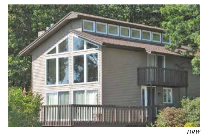
Figure 2-37. This house has two sets of clerestory windows. One is between the roof planes. A triangular clerestory is located over the main windows in the side