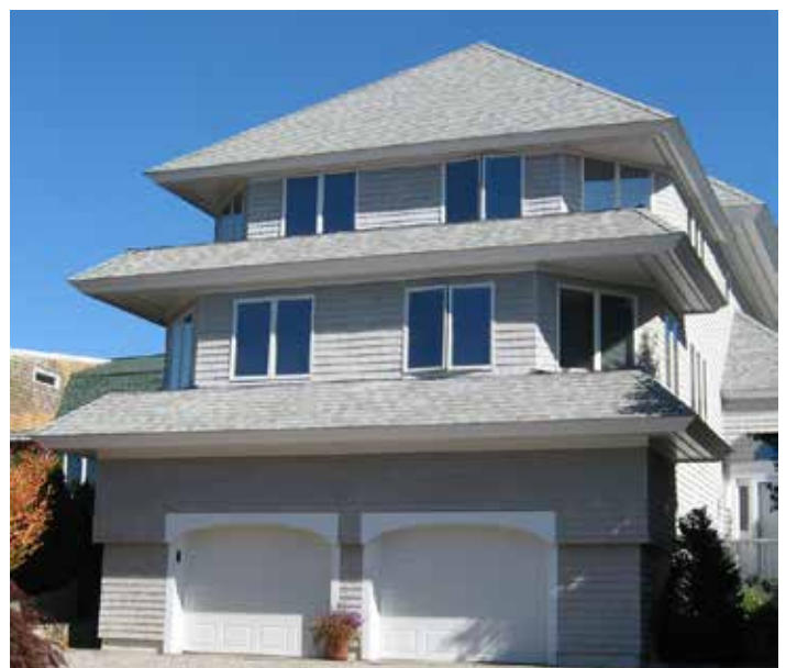
Figure 2-17. False eaves on a Florida house. At this sun angle, approximately half of the window area is shaded. as precisely oriented toward true south as for the other types of exterior shading. Even if the wall is turned as much as 30° from true south, it is still practical to shade the entire wall during the warm months.

This shading geometry is especially valuable in the mid-latitudes and higher, where there are both extended warm and cold seasons. During the warm season, when the sun is high in the southern sky, the gable overhang can shade a relatively large amount of glass throughout the day. During the winter season, the lower winter sun can illuminate the windows for solar heating.